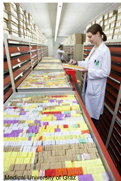
Medical University of Graz

This unprecedented network could allow people to become aware of their susceptibility to specific disease conditions, opening the possibility of personalised medicine (targeted diagnostics and treatments). At the same time, BBMRI will support policy and scientific momentum to harmonise ethical, legal and quality standards across Europe.